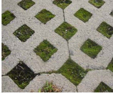
Figure 1b. CGP