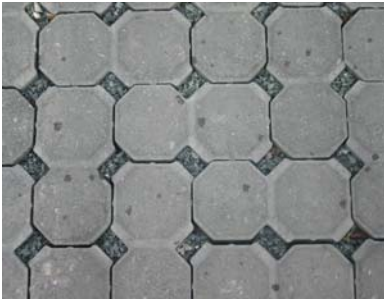
Figure 1a. PICP

voids located at the corners and midpoints of pavers. PC is different from standard concrete in that fine aggregate has been removed from the mix, allowing interconnected void spaces to form during curing. Permeable pavements allow drainage through the existence or formation of these void spaces.