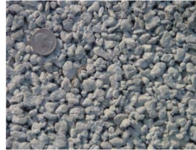
Figure 1c. PC

Recent research conducted at North Carolina State University has focused on several topics relating to permeable pavement function, including: (1) water quality impacts of permeable pavement; (2) longer term runoff reduction; and (3) preventing and mitigating clogging of permeable pavements. The first and second studies examined three permeable pavement sites in North Carolina where water samples were collected for pollutant analysis. Two of these sites in eastern North Carolina were instrumented to measure rainfall and runoff rates. The third study monitored surface infiltration rates at 40 permeable pavement sites in North Carolina, Virginia, Delaware, and Maryland. Only topics (2) and (3) are discussed herein.